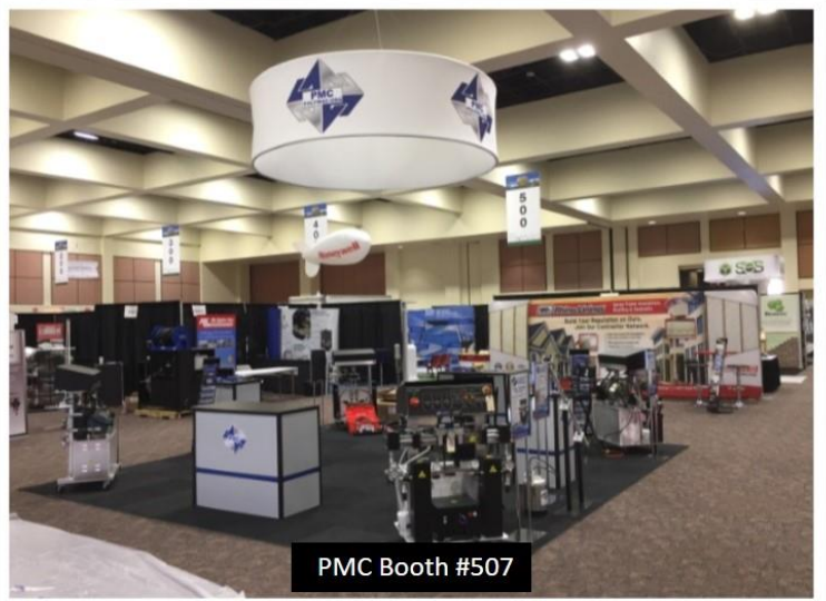
PMC Booth #507